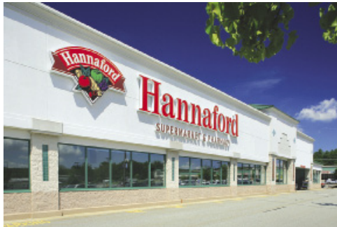
Derry Meadows Shoppes, 35 Manchester Road - Derry, NH